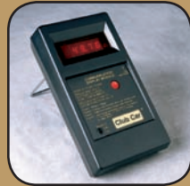
Communication Display Module

*Headlights, Taillights, Brakelights and Horn