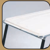
Canopy Top White and Beige