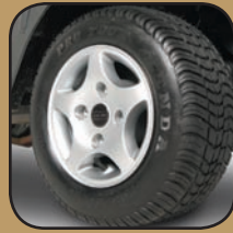
10-Inch Aluminum Alloy Wheels